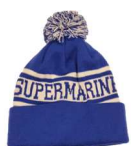
Bobble Hat £9:00